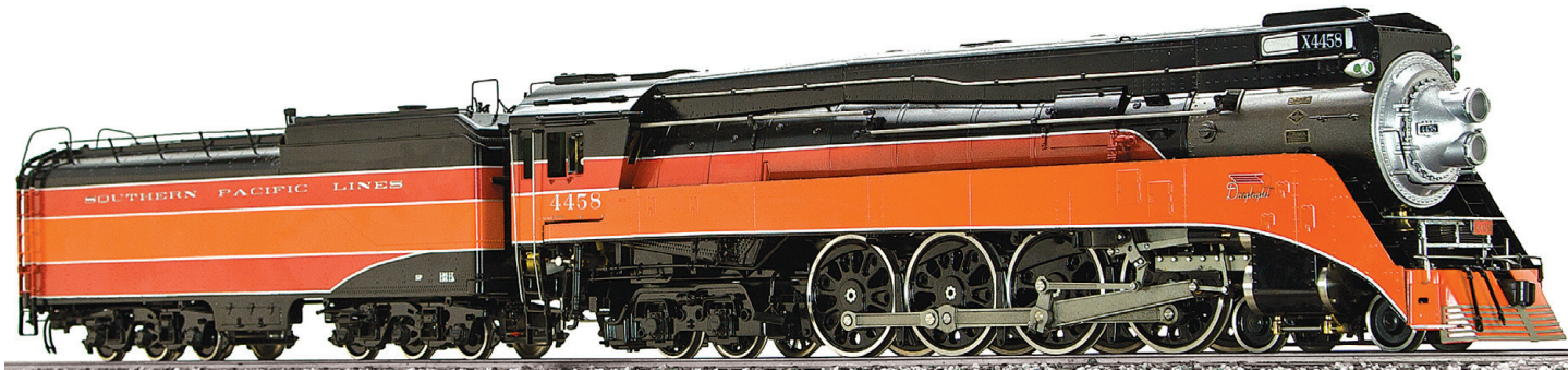
AL97-005 SP GS-5 #4458 Daylight