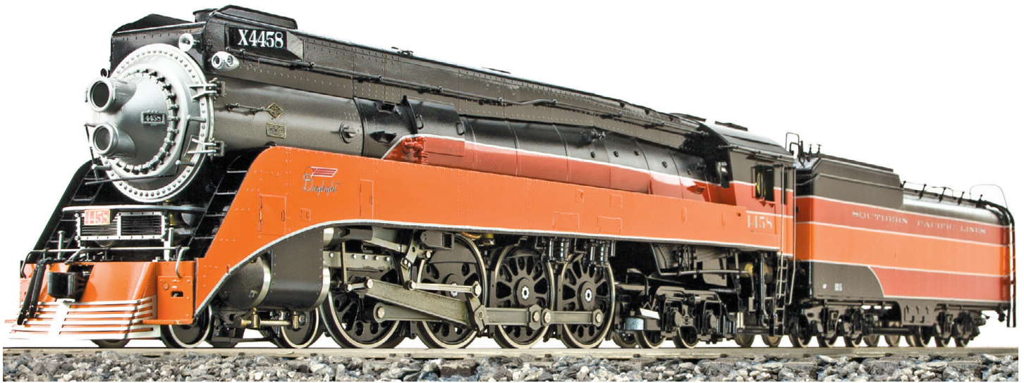
AL97-005 SP GS-5 #4458 Daylight

Southern Pacific GS 4-8-4 locomotives ran from class GS -1 through GS-8. The Daylight painted locomotives were GS-2 through GS-5! The GS-4's were the double headlight versions, and the last two of this series were made with roller bearings. These were class GS-5. No. 4458 was equipped with Timken roller bearings and No. 4459 used SKF roller bearings. Both these engines ran well over one million miles during their careers, and both Timken and SKF wanted to examine the bearings on both engines when they were scrapped! Both locomotives showed minimal wear after all those miles! No. 4458 lasted in service the longest and could be found in black paint pulling the valley daylight until late 1956! Pentrex video has some wonderful DVD color movies of this engine running at high speed in those last years! GS-5 #4458 was the pinnacle of steam power on the Southern Pacific!