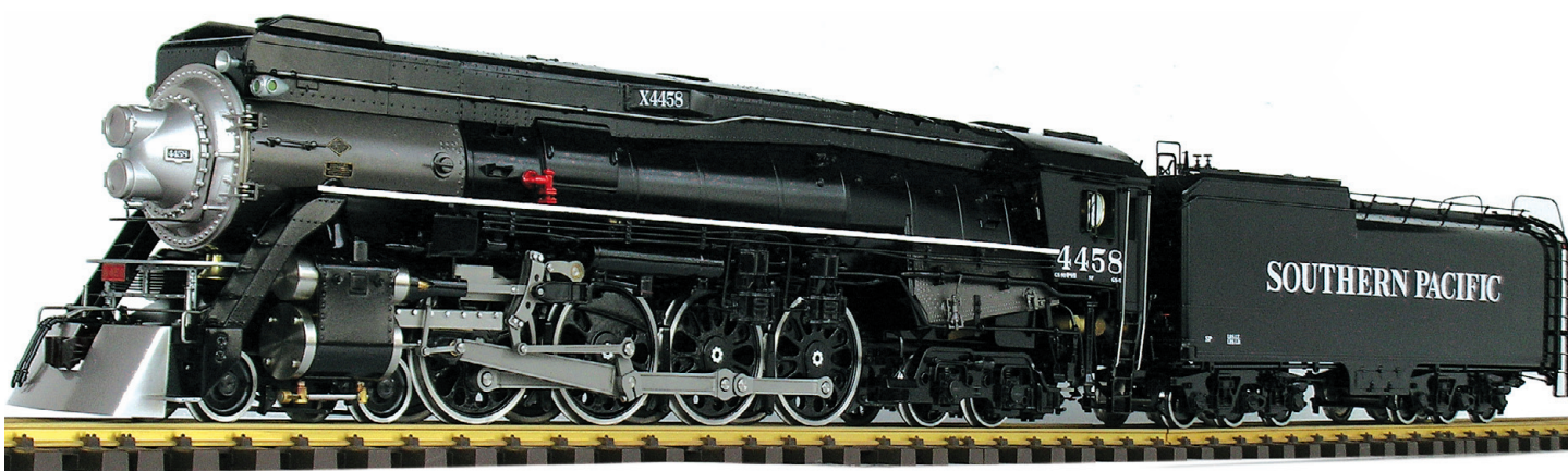
AL97-007 SP GS-5 #4458 Black